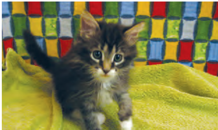
Two-month old kitten Emily found a second chance through Spay & Save

Occasionally, there are cats who need a little more help. Case in point—a tiny kitten named Emily. A client called the Spay & Save hotline to make an appointment for a cat who had just weaned her kittens. We learned in our conversation with her that only one of the litter had survived, and that the client did not have the resources to care for two cats. One of our surgery partners agreed to spay the female cat and accepted the very young, very sick kitten in their foster care program, where she could receive the necessary care until she was old enough to be spayed and made available for adoption. Within hours of being put up for adoption, Emily the kitten found a loving new home—and both she and her mother continue to enjoy their lives as beloved, sterilized family pets.