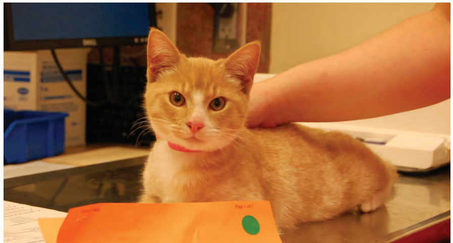
Spay & Save patient Leo is ready for his big day